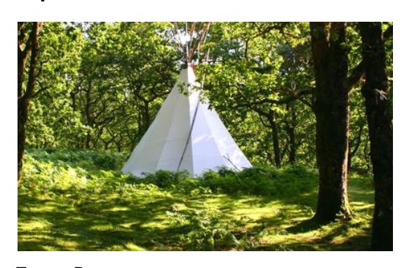
Tepee, Powys

Conical shaped tent comprising rounded wooden pole frame covered with canvas. Tepees often have wood burners and beds. Typically larger, more complex to erect and more permanent than traditional tents given their wooden bases which generally remain in situ throughout the year. Upper parts of the structures can be easily removed.