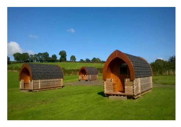
Wooden Pods, Llantillio Croesenny

Typically simple timber structures comprising a floor, sides and roof with no services although it is recognised that some types of pods/tents incorporate beds/heaters and may be connected to services. Wooden pods/tents are generally transported onto a site as a complete unit and simply placed on land (no foundations). They cannot be categorised as touring units given their greater degree of permanency.