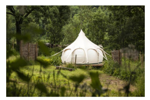
Bell Tent, Kingstone Brewery, Tintern

Conical shaped tent supported by a single central pole and covered with canvas. Bell tents can have beds. Can be more permanent than traditional tents where they have wooden bases which may remain in situ throughout the year.