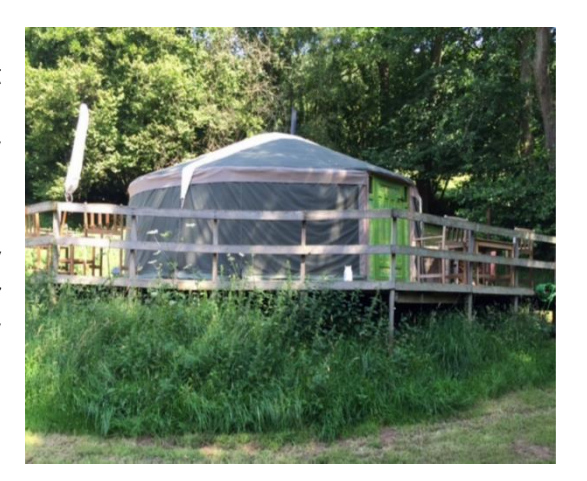
Yurt, Hidden Valley Yurts, Llanishen

Large circular tent structures, comprising a latticed wooden frame with felt insulation and canvas cover. Yurts often have wood burners and beds. Typically larger, more complex to erect and more permanent than traditional tents given their wooden bases which generally remain in situ throughout the year. Upper parts of the structures can be easily removed.