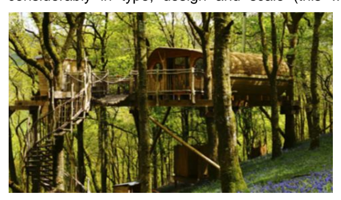
Tree House, Powys

Structures built next to and/or around tree trunk/branches above ground level. Some have beds/ facilities while others comprise a single open space /no facilities. Can vary considerably in type, design and scale (this would determine whether it would