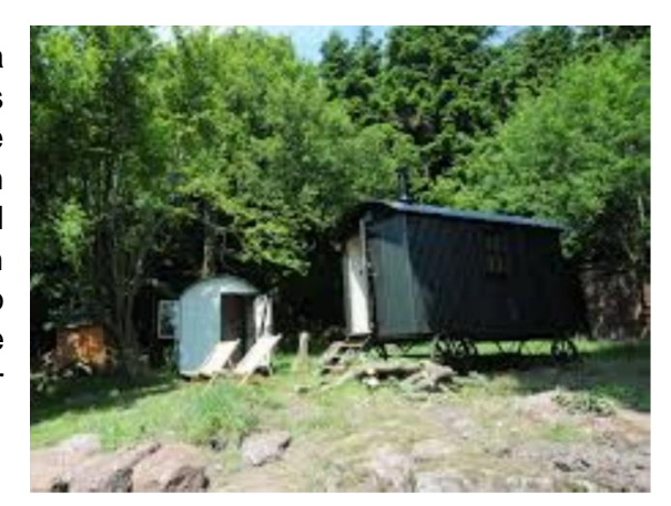
Shepherd's Hut, Penallt

19th and 20th century version of a modern caravan. Shepherd's huts typically comprise a solid wooden frame on cast iron wheels with corrugated iron roof and sides. Often have beds, wood burners and other facilities. As with wooden pods, they are transported onto a site as a complete unit. They cannot be categorised as touring units given their greater degree of permanency.